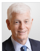
MARIO J. GABELLI, CFA Chief Executive Officer GAMCO Investors, Inc.