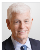
MARIO J. GABELLI, CFA Chief Executive Officer GAMCO Investors, Inc.