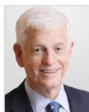
MARIO J. GABELLI, CFA Chief Executive Officer GAMCO Investors, Inc.