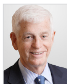
MARIO J. GABELLI, CFA Chief Executive Officer GAMCO Investors, Inc.