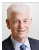
MARIO J. GABELLI, CFA Chief Executive Officer GAMCO Investors, Inc.