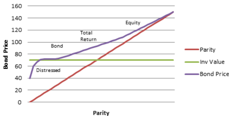
Graph 1 - Typical Convertible Bond Payoff

The majority of convertible securities are professionally managed either in Separately Managed Accounts, open-end or closed-end funds or are used as an alternative to common stock in an equity portfolio. As seen in the DPG Study of Convertible Performance and Volatility (Table 2), broad portfolios of convertible securities have shown the ability to compete with equity indices on a total return basis over full market cycles. They have accomplished this with less volatility in those returns.